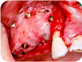
Fig. A Lateral Sinus lift procedures to fix CopiOs® Pericardium Membrane.