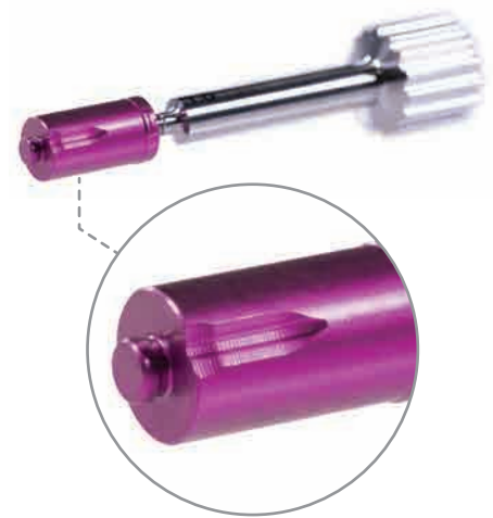
One-position locking design