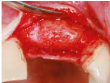
Fig C Revascularized block graft after healing time.