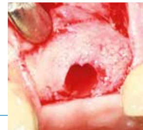
Fig D Implant bed after 4.5 months healing time: recovered ridge width.

Individual results may vary.