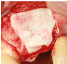
Fig C Bone graft covered with CopiOs® Pericardium Membrane.