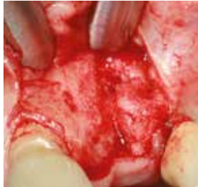
Fig A Bony defect region 21.