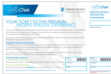
BellaChek™ Coupon for Definitive BellaTek Abutment