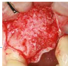
Fig B Puros Allograft Cancellous Particles in place.