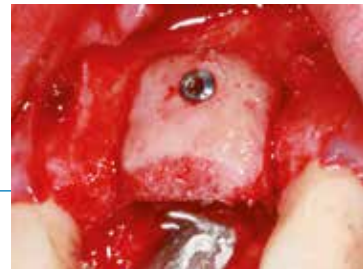
Fig B Puros Allograft Block in place.