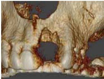
Fig A 3D analysis of bony defect.