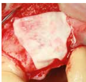
Fig C Bone graft covered with CopiOs® Pericardium Membrane.