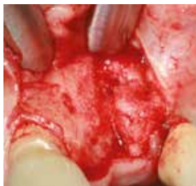
Fig A Bony defect region 21.