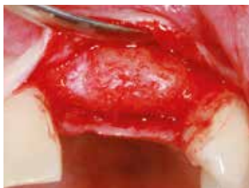
Fig C Revascularized block graft after healing time.