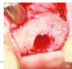
Fig D Implant bed after 4.5 months healing time: recovered ridge width.