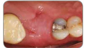
Figure D Two months postoperative.

Clinical photos ©2013 Dr. El Chaar† All rights reserved. Individual results may vary.