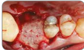
Figure B CopiOs Extend Membrane was laid over the graft and tacked under the flap.