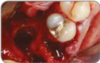
Figure A Clinical image showing the extensive bone loss on the palatal area extending past apex.