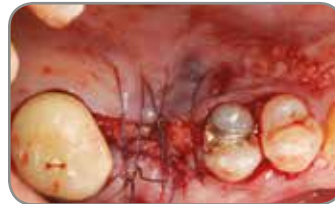
Figure C Flap sutured over the membrane.