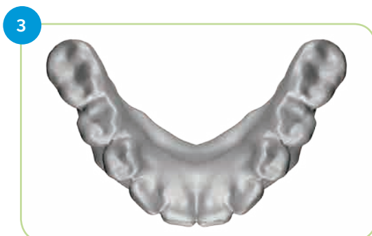
3 Scan the opposing arch and bite registration.