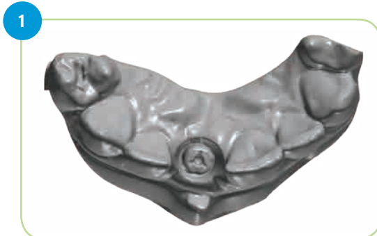
1 Scan the TSV BellaTek Encode Healing Abutment with an intraoral scanner following the manufacturer's instructions.