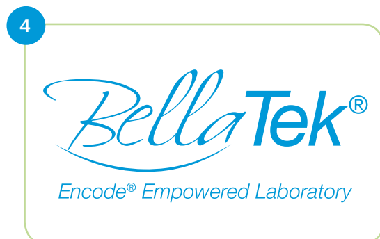
4 Submit scan to your Encode Empowered Laboratory.